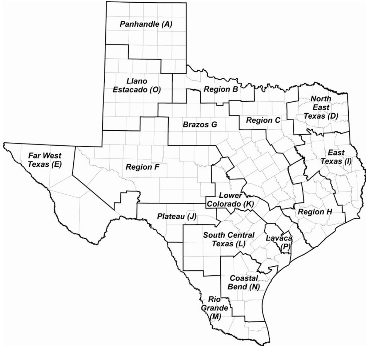
Figure 1: Map of the Regional Water Planning Areas